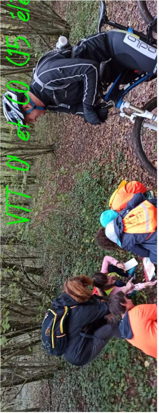
VTT D et CO (15 élèves)