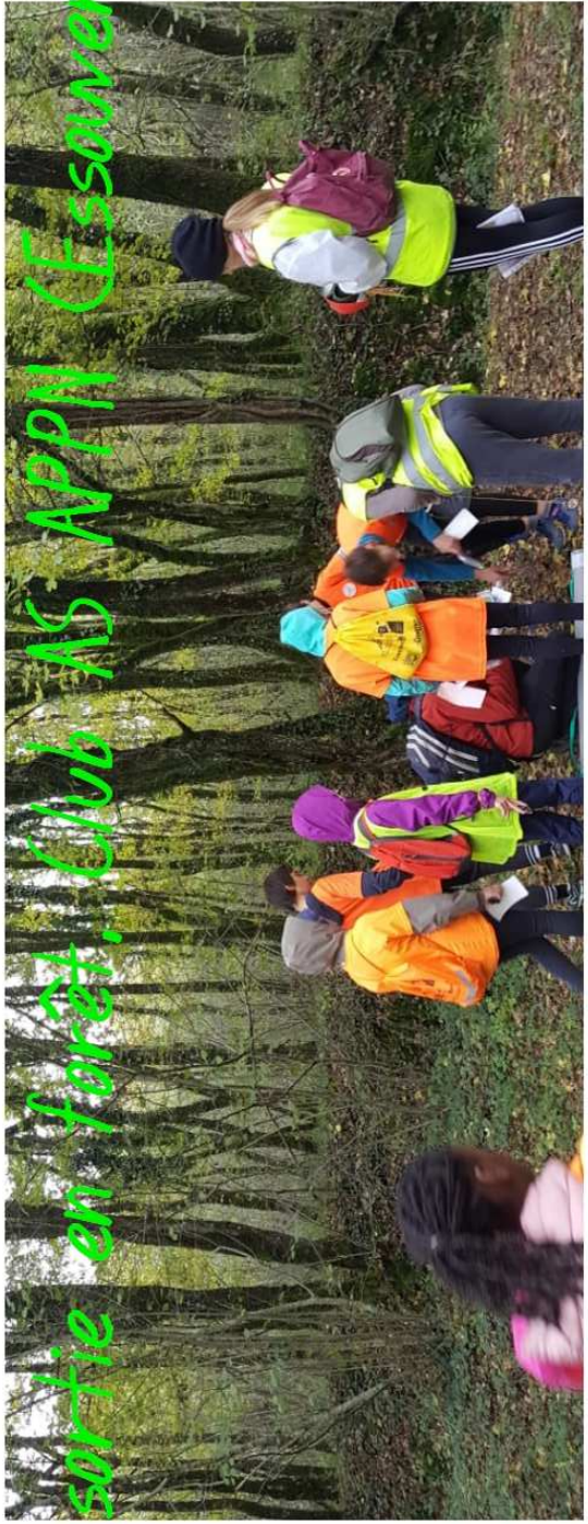
sortie en forêt, Club AS APPM (Essaert.17)