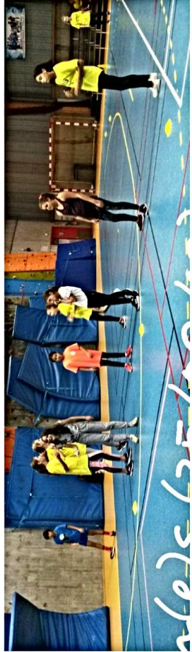
filles et garçons (classeme