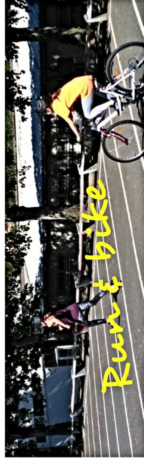
Run & bike